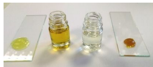
Extraction of lavender flowers by pure CO 2 : 280 bar; 40°C. From left to right: Crude CO 2 extract – Cold filtrated extract – Molecular distillation distillate and residue.